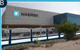
Plot no. S50120, at Gate 14 JAFZA