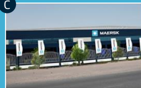
LOB 3 5th Roundabout, Mina JAFZA